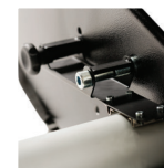
BRAKE mechanical, precise: optimal paper tension