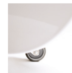
DESIGN ergonomic, exclusive, user-friendly