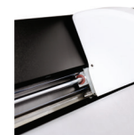
CARRIAGE fast, fluid: increased quiet