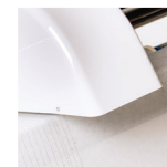
PRINTING excellent graphics, accurate dimensions